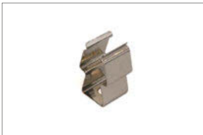
Mounting Bracket 1 M00000074